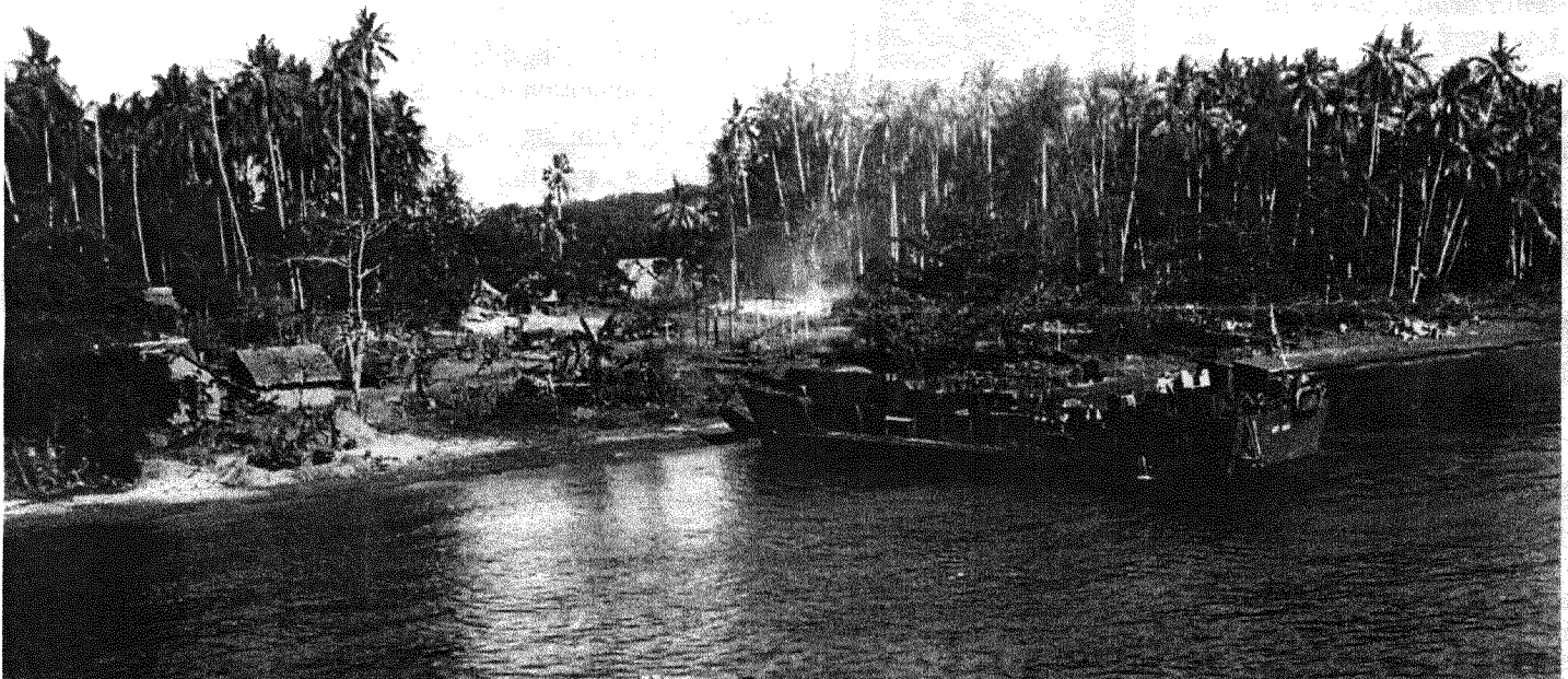
Above: LCT-325 at Mono Island (south of Bougainville in the Solomons) just after Allied ammo dump was hit by Jap mortar fire near native village, 27 Oct., 1943.