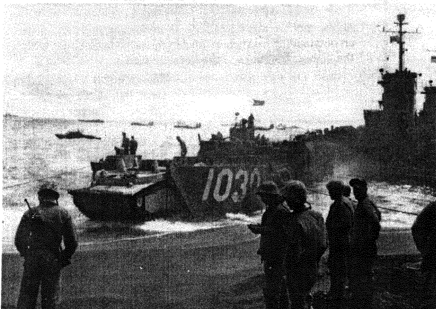
At Left: LCT-1030 unloading an LVT (Landing Vehicle, Tracked) on Green Beach, Iwo Jima, 25 Feb., 1945.