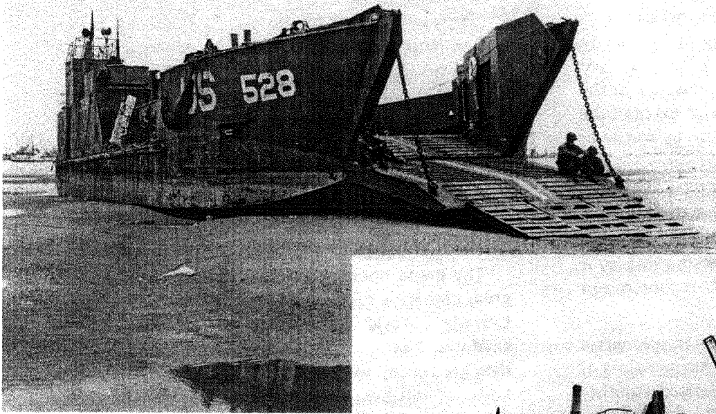
At Left: LCT-528 (Flot 4) on the beach after unloading operations, 15 June, 1944. The 528 took part in the 6 June landings at Utah Beach (Tare Green) H+360.