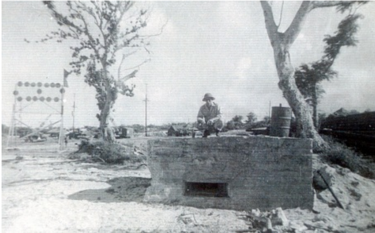
Concrete Japanese pillbox on Tinian after the island was secured by Allied forces.