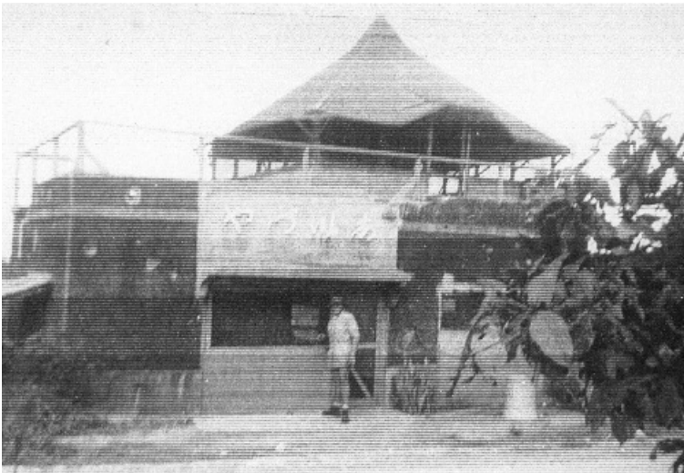
Japanese Headquarters on Tinian Island.